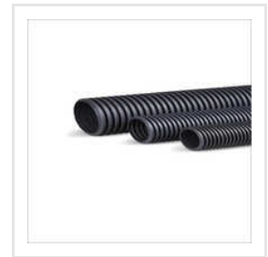
HDPE Sheathing Pipe