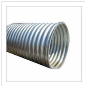
Circular Corrugated Pipe