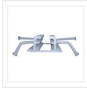
Strip Seal Expansion Joint