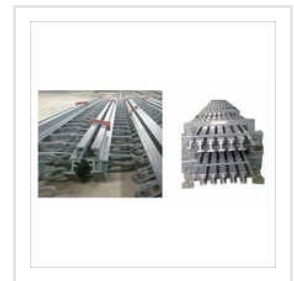
Strip Seal Expansion Joints