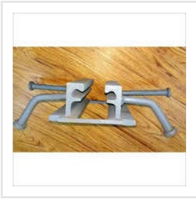
Stripseal Expansion Joint