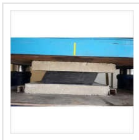
Neoprene Bridge Bearing