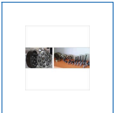
BEARINGS & WEDGES (GRIPS)