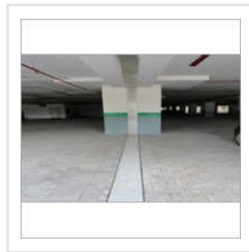
Architectural Expansion Joints