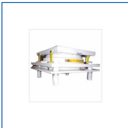
PTFE BRIDGE BEARING