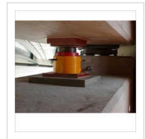
Fixed Bridge Bearing