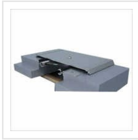
Arch Expansion Joints